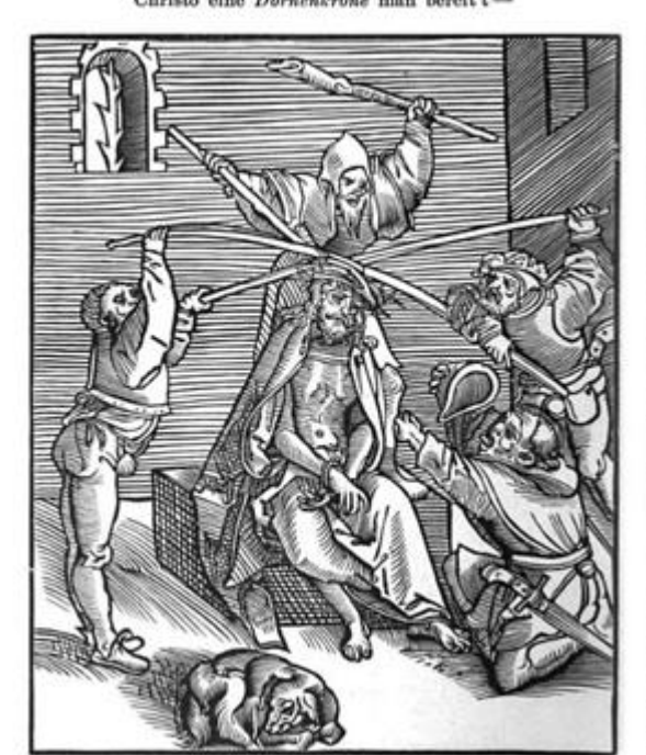
Passional Christi Christo eine Dornenkrone man bereit't—