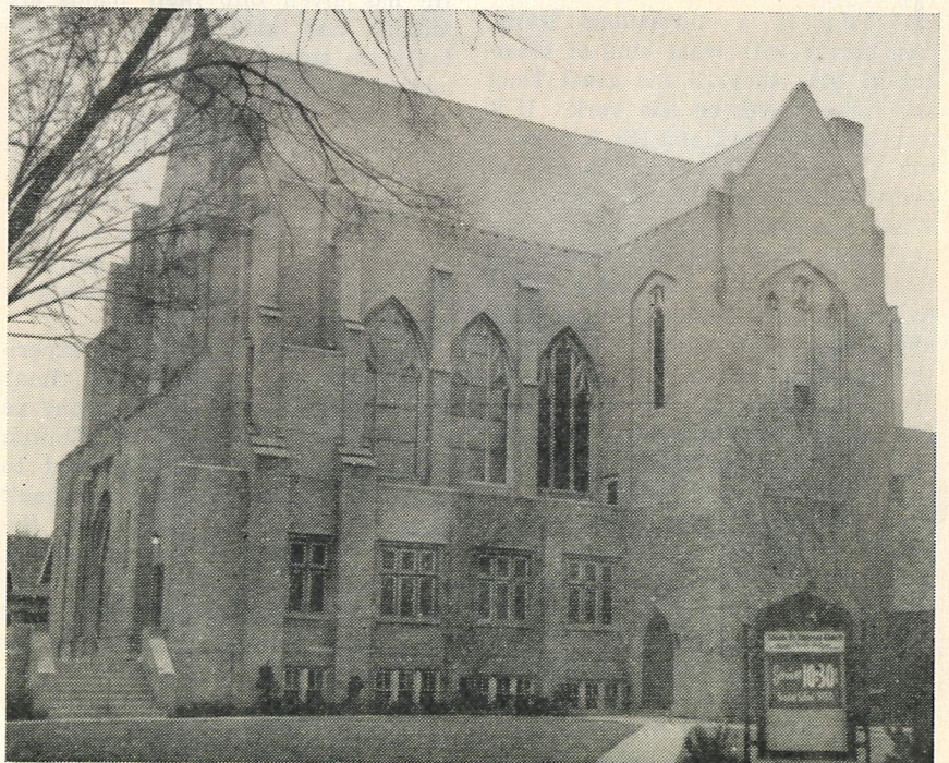
ZEBAOOTH LUTHERAN CHURCH — MILWAUKEE