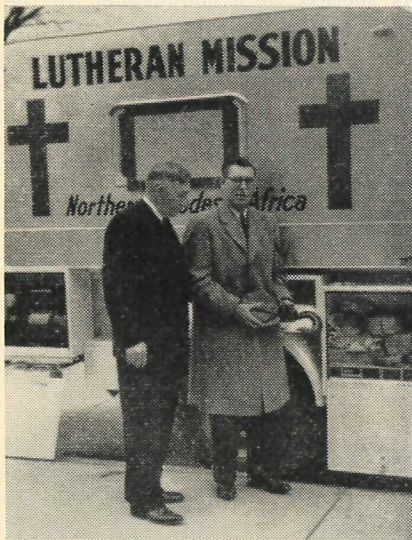
FROM THENCE TO NORTHERN RHODESIA