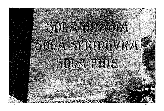
Seminary Corner Stone