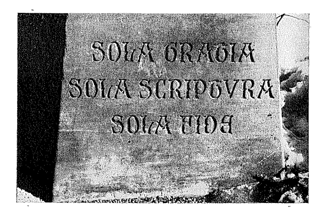
Seminary Corner Stone