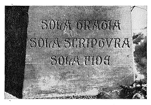
THE CURRICULUM Corner Stone