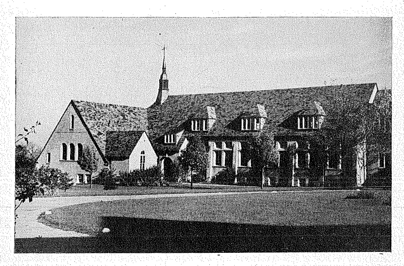
Classrooms, Library, Chapel

(Lectures on five days of the week, beginning at 7:30 A. M. Length of regular lecture period, 50 minutes.)